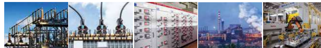
Transmission Inspection Distribution Inspection Distribution patrol inspection Metallurgy and Petrochemical Industry Production and Manufacture