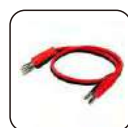
Test Leads (optional)